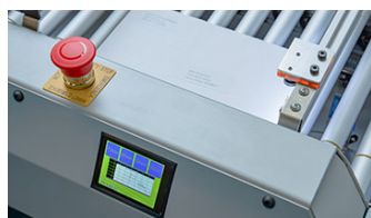
Clear zone monitor