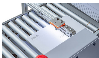
Clear zone detect - front view